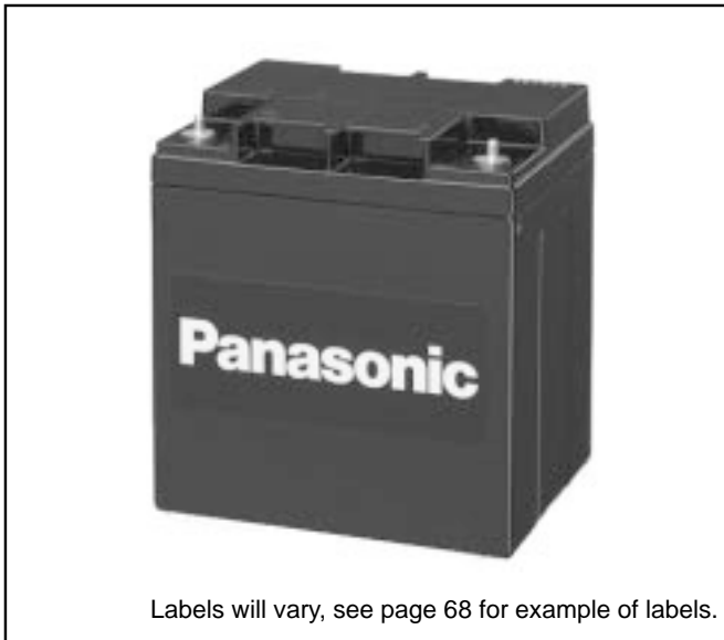
(a) The photo and dimensions represent LC-X1228AP